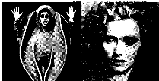
"WE'RE TALKING VULVA" GRETA GARBO

In this 1933 movie Katherine Hepburn has her first starring role. Significantly it is in a film written by a woman, Zoe Akins, and directed by a woman, Dorothy Arzner, portraying female independence and solidarity. Hollywood has called Hepburn, Lady Cynthia Darlington, but we "know" she is Amelia Earhardt, the famous aviatrix. In this version she meets Sir Christopher Strong and stops wearing slacks to become a languishing "femme". If you hate to be told the ending of the films read no further! . . . Hollywood, which worshipped the dollar was faced with a real problem. To be true to the spirit of the film the heroine must die, which could result in a boxoffice flop. So when Sir Christopher demands Cynthia's obedience and tells her to ". . . give up your childish romping ways!", it is a case of give me liberty or give me death.