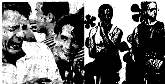
"LONGTIME COMPANION" GAY DATING GAME SHOW