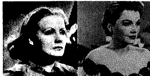
"QUEEN CHRISTINA" "ALL ABOUT EVE"