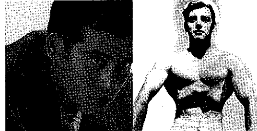
"I AM A MAN" PROGRAMME 20